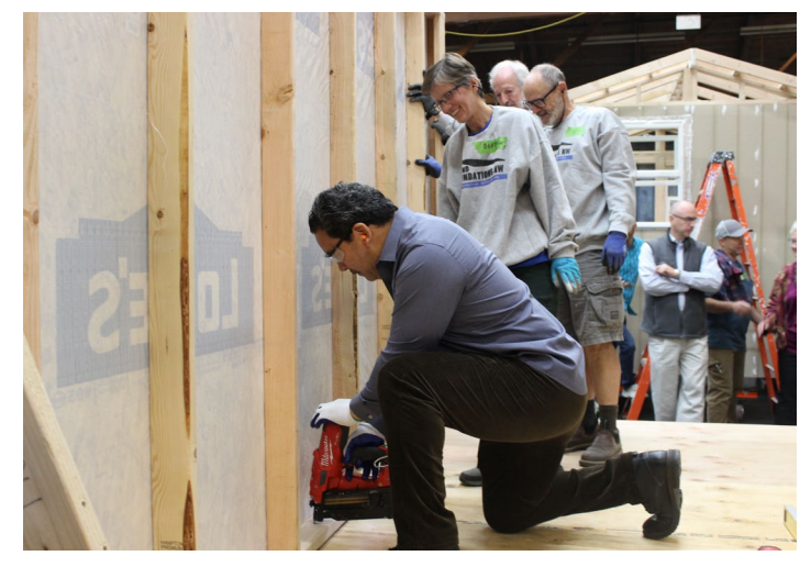
Mayor Harrell helps volunteers build a tiny home.

• Mayor Harrell is advancing practical approaches to quickly create more housing, like <u>exempting affordable</u> <u>housing projects from design review</u>. The budget includes the largest one-year investment in affordable housing in City history – approximately $250 million.