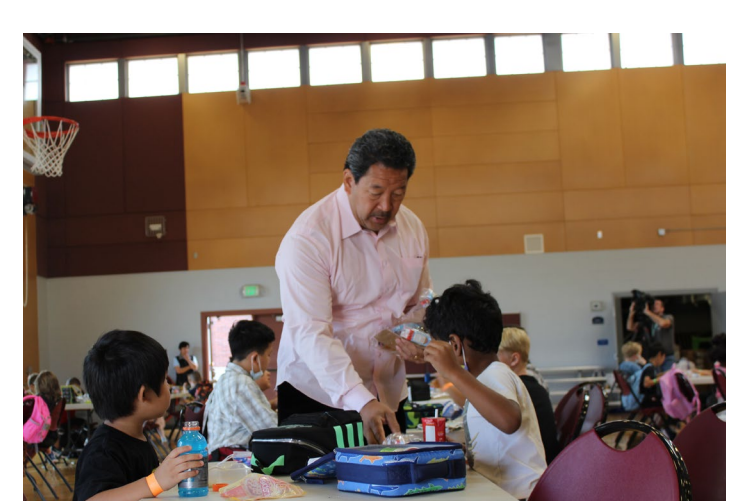
Mayor Harrell hands out free lunches to students in Beacon Hill.

Mayor Harrell signs abortion protections into law in Seattle.