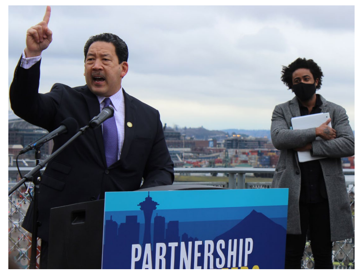
Mayor Harrell announcing launch of Partnership for Zero with KCRHA.

referrals to help people indoors in 2022