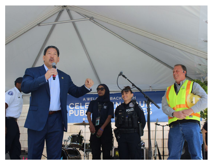
Mayor Harrell hosts employee Welcome Back Bash at City Hall.

• The City's Parks District budget funds the creation of new parks, reestablishes the Park Ranger program, and invests in delivering renovations and essential maintenance to Seattle's nearly 500 parks, keeping bathrooms open and addressing vandalism – ensuring our parks are clean, safe, and open to all.